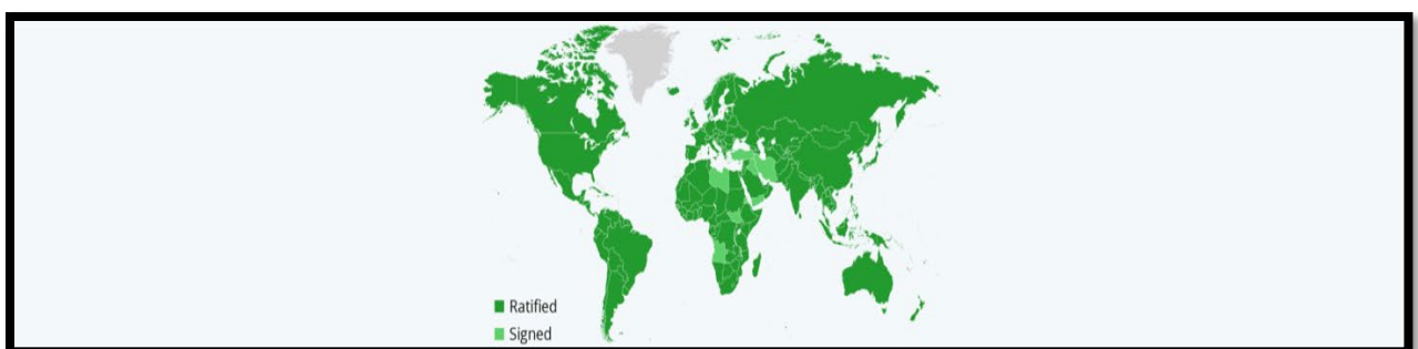
Figure 1 – Countries by their participation in the Paris agreement as of April 2021

Good recent examples are: Montreal Protocol; United Nations Framework Convention on Climate Change; Kyoto Protocol; Paris Agreement, etc. The possible global level of countries' participation in them can be understood thanks to the official UNFCCC data, based on the last example in Fig. 1.