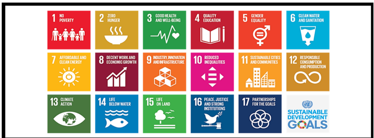
Figure 2 – Sustainable Development Goals

To achieve success, it is important to take into account each of them, set specific objectives and appropriate goals. In 2015, the General Assembly adopted the 2030 Agenda for Sustainable Development. All 17 Sustainable Development Goals can be seen in Fig 2.