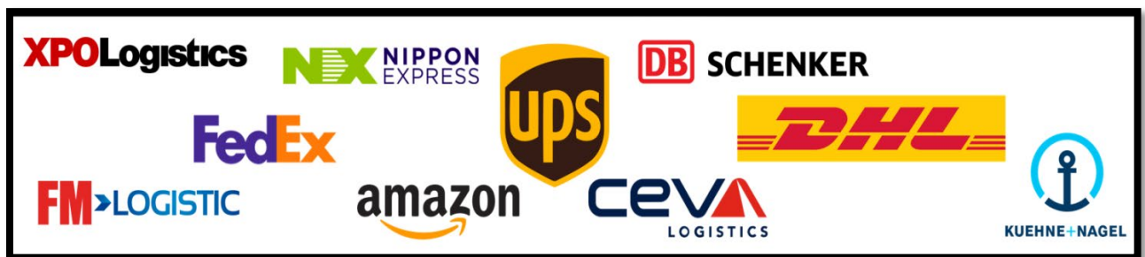
Figure 4 – Logistics companies that have effective green business strategies

experience in green business strategies from other well-known international companies. Such logistics companies with effective green business strategies can be presented in Fig. 4.