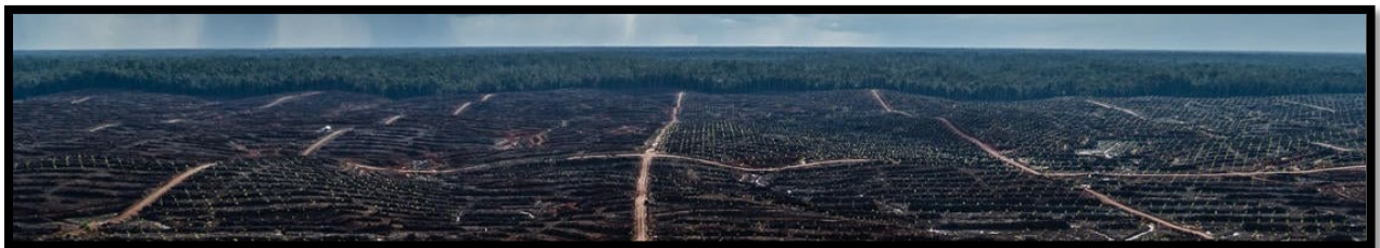
Figure 5 – A modern example of deforestation

The second, no less important reason was deforestation, which was becoming increasingly widespread in the world. Even now, it can still be found in many countries, as shown in Fig. 5.